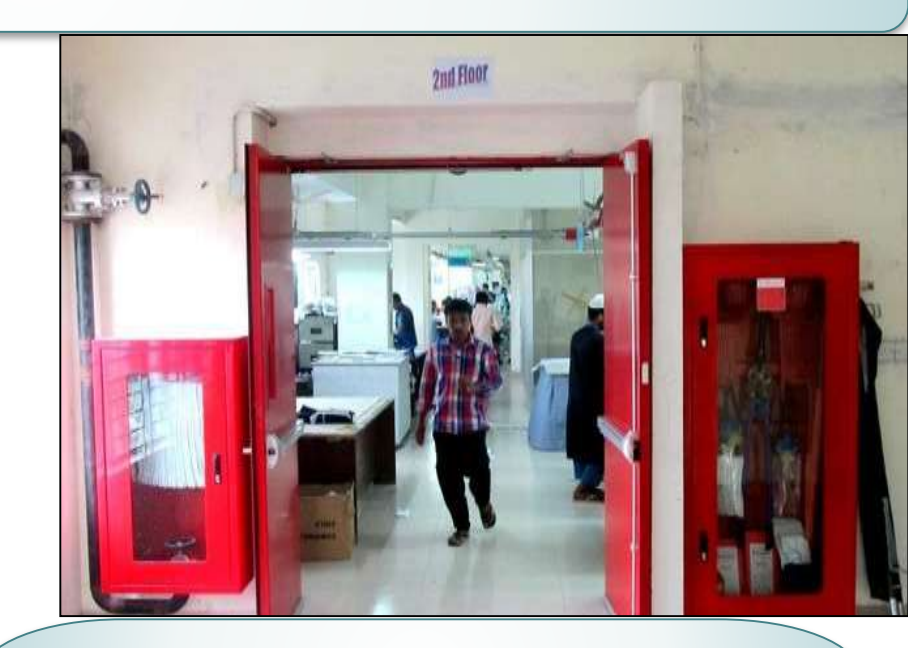
FIRE DOOR INSTALL